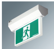
Surface Mounted Version Available