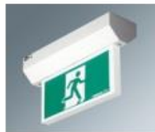
Surface Mounted Version Available