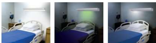
Uplight & Downlight